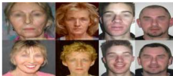
Fig 2. Sample face images of Local Plastic surgery from PSD[22]

Out of above mentioned challenges we have been focus on one of the emerging issue is local Plastic surgery. The survey has concentrated on three local region of the face as Lip surgery, nose surgery and eyelid surgery. Database of Image Analysis and Biometrics Lab IIIT Delhi, Plastic Surgery Face Database and Frontal Face Database[22]. The database of local plastic pre and post-surgery of Blepharoplasty-Asian-eyes, Lip-Augmentation and Rhinoplasty-Nose-job-nose-surgery is used. Blepharoplasty- Asian-eyes is the surgery of eye lids, Lip-Augmentation is the surgery of lips and Rhinoplasty is the surgery of nose. The sample face images from the Plastic Surgery Database is shown in fig. 2.